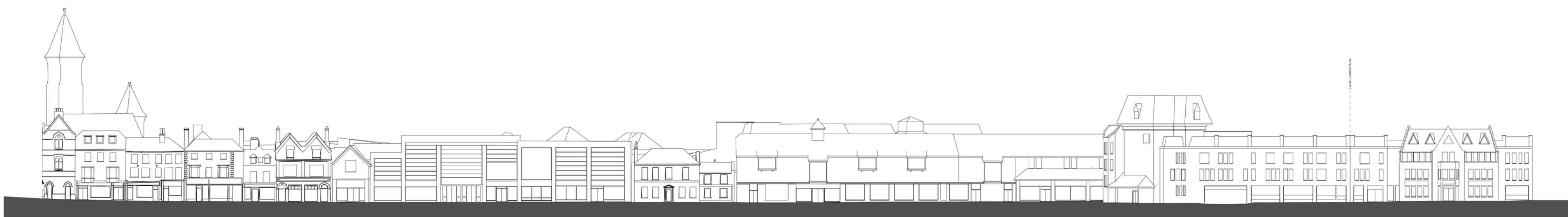
3 Existing Bartholomew Street Elevation 1 : 500