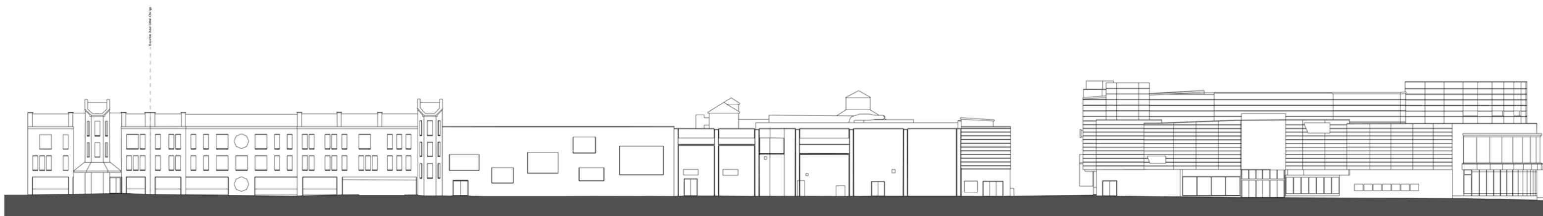
2 Existing Market Street Elevation 1 : 500