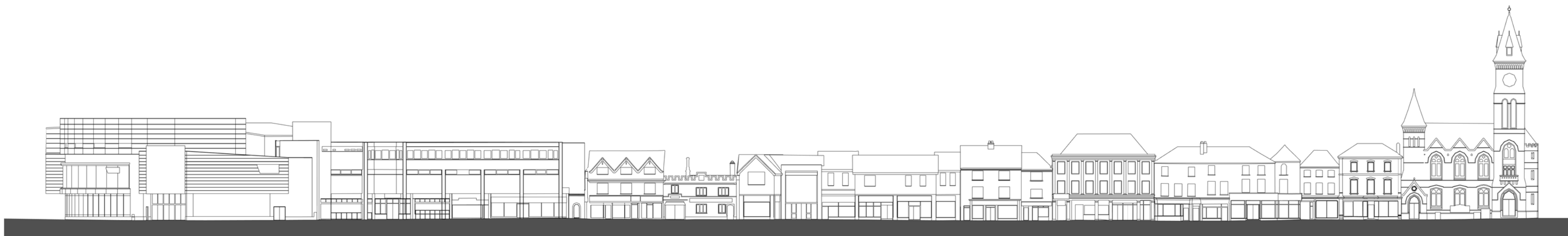
1 Existing Cheap Street Elevation 1 : 500