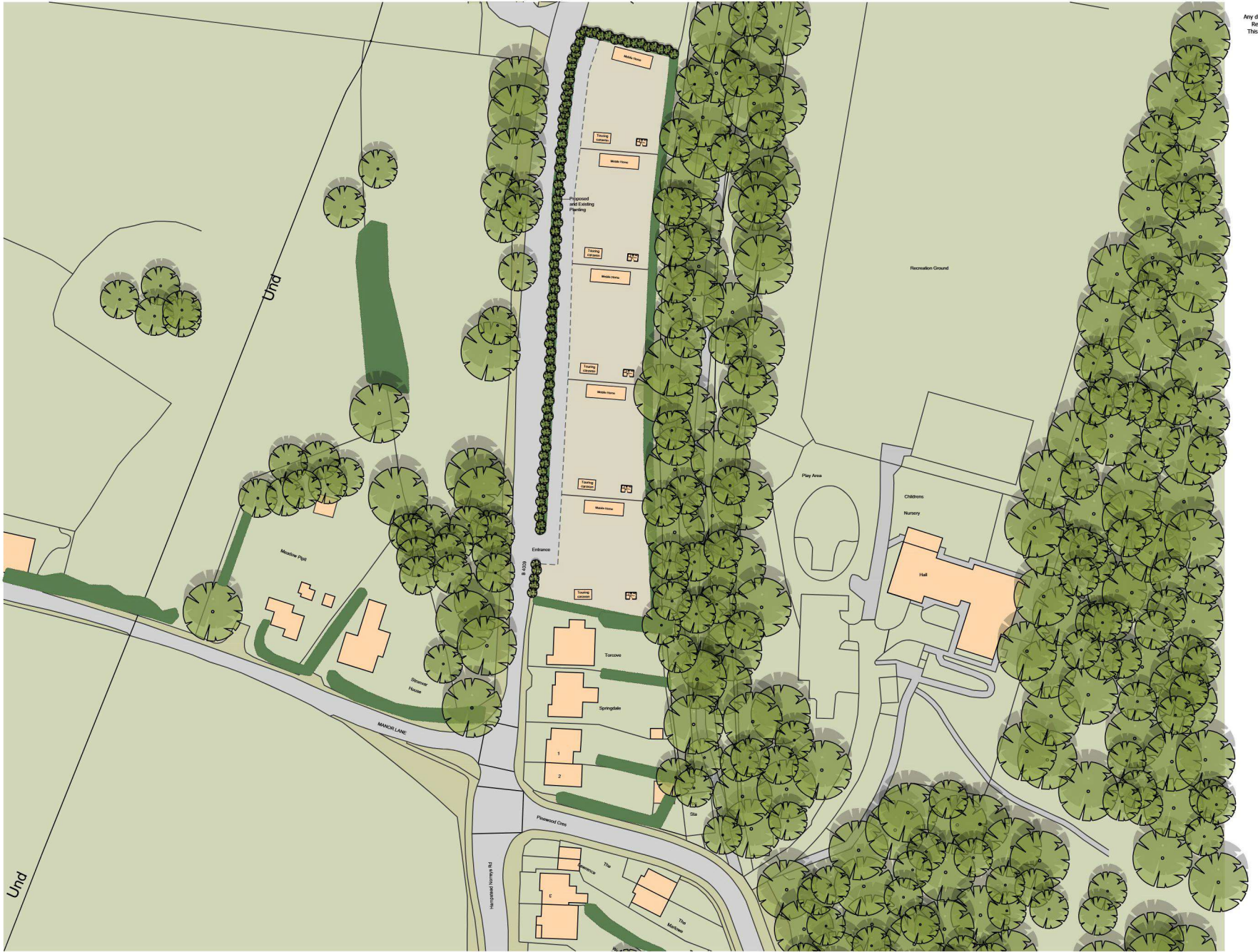
As Proposed Site Plan