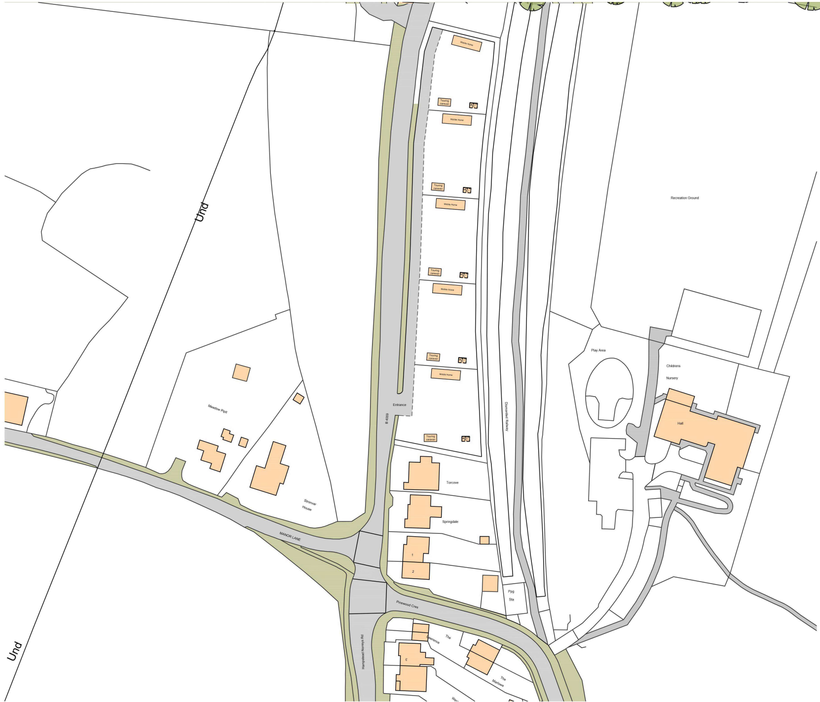
As Proposed Block Plan