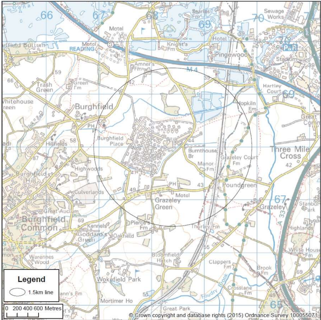
Map 1: Map of Burghfield 2002-2018 REPIR off-site emergency planning area