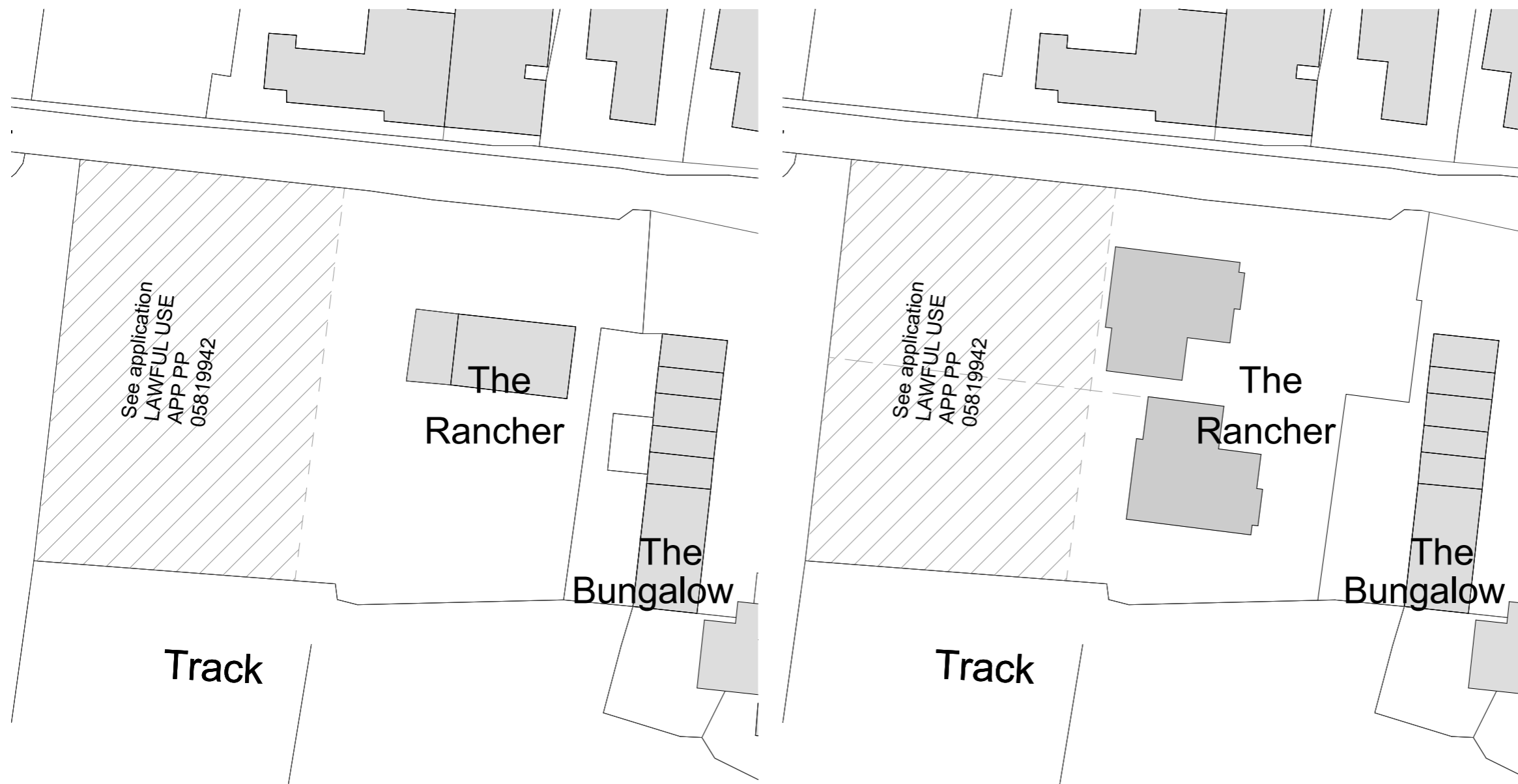
1 Existing Block Plan 1:500