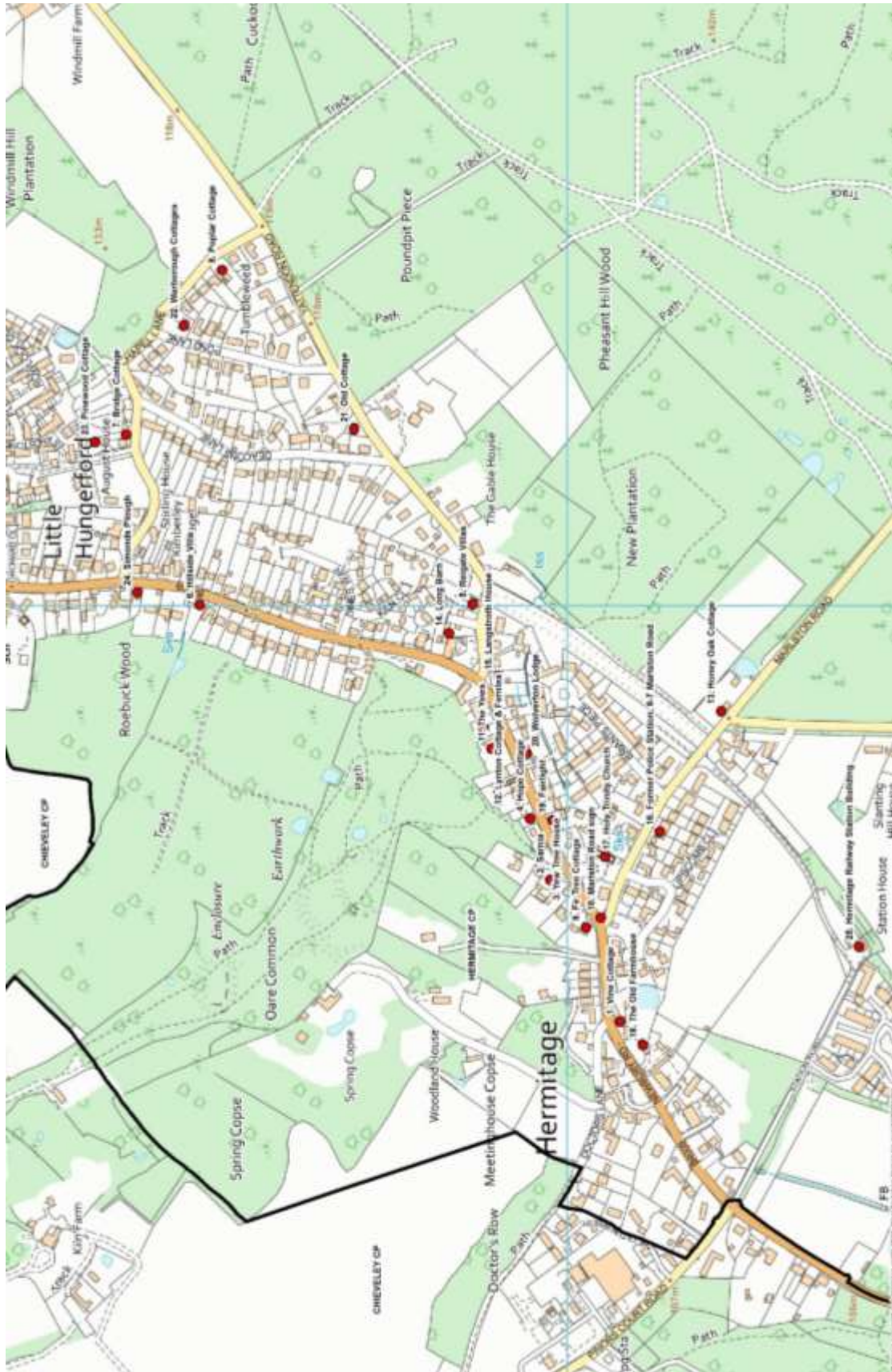
Figure 7.1: Map of Non-Designated Heritage Assets