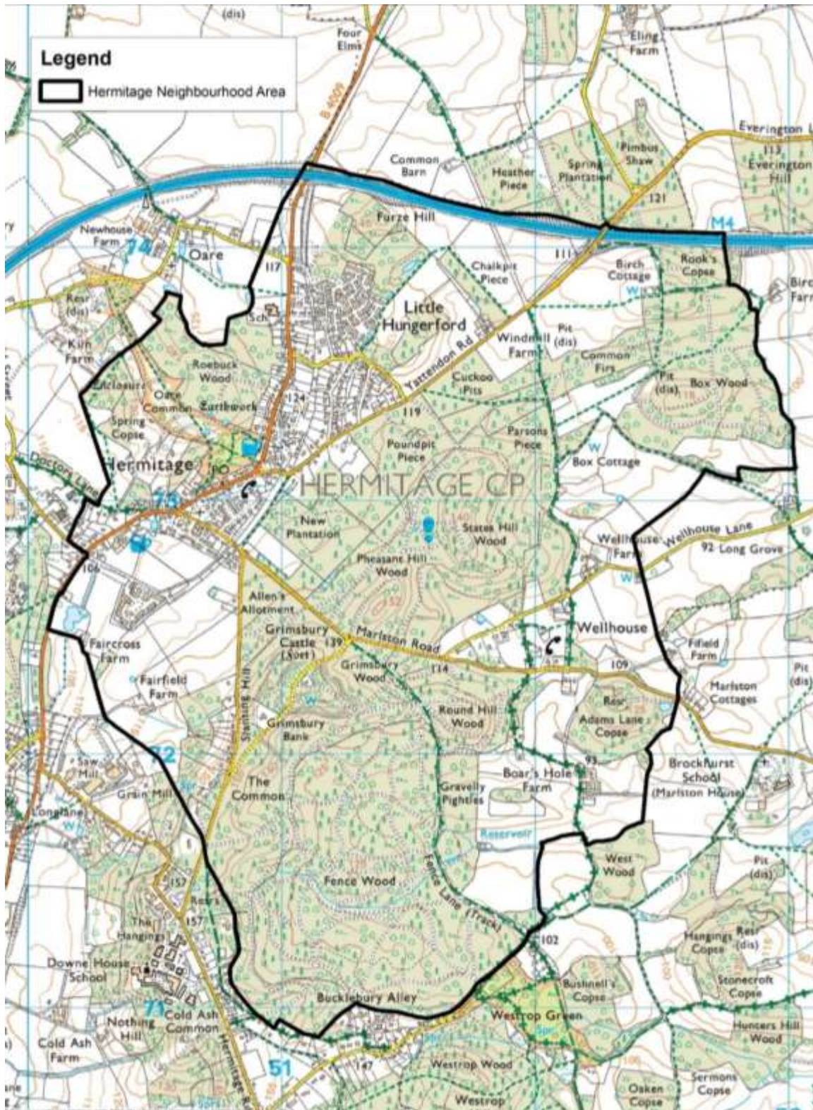
Figure 1.1: Hermitage Neighbourhood Area/parish boundary

Prepared under Hermitage Parish Council's Ordnance Survey Public Sector Geospatial Mapping Agreement (PSGA) no. 100055937