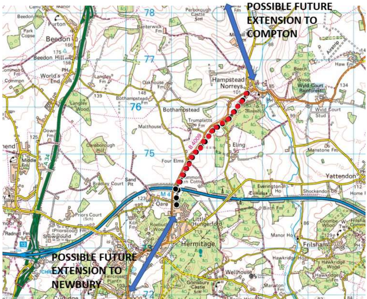
Figure 8.2: Map of Eling Way, including possible extensions