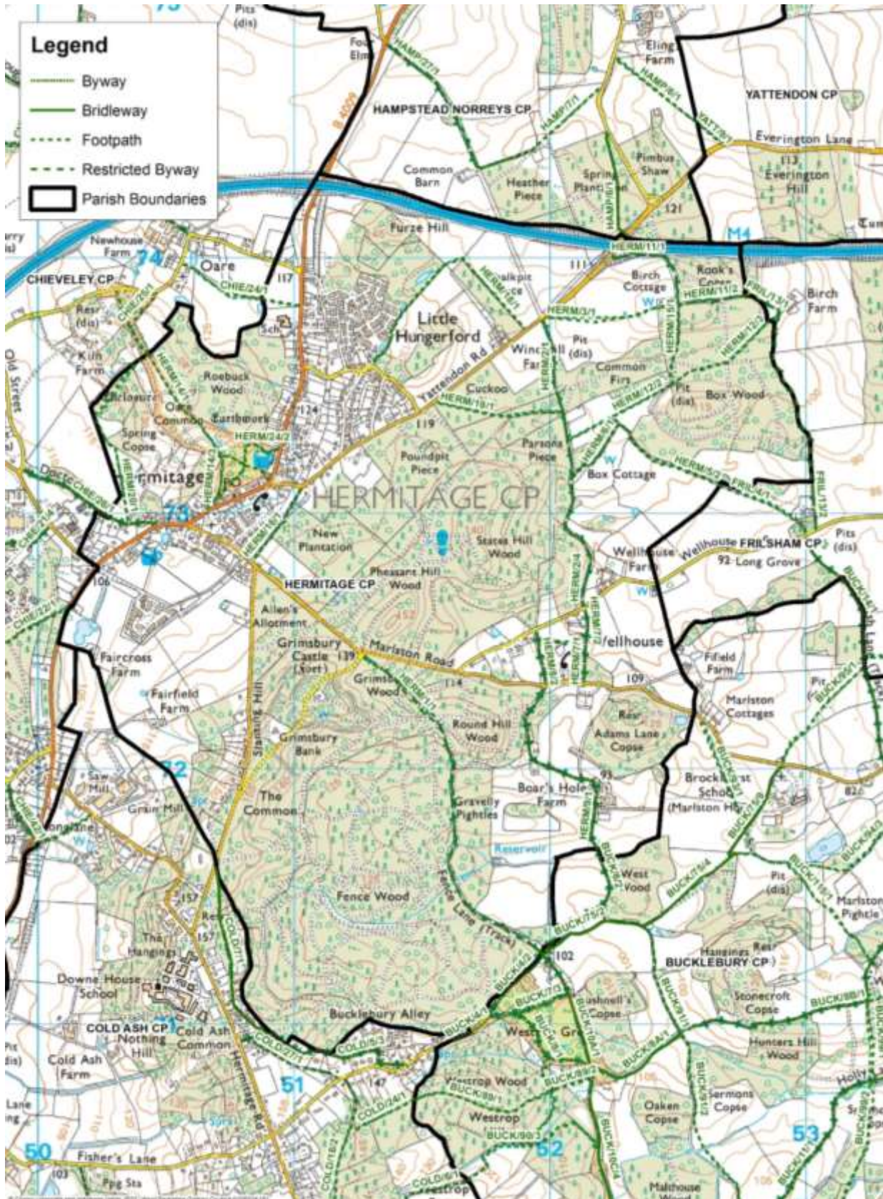
Figure 8.1: Public rights of way in Hermitage parish

© Crown copyright and database rights 2022, West Berkshire District Council 010024151