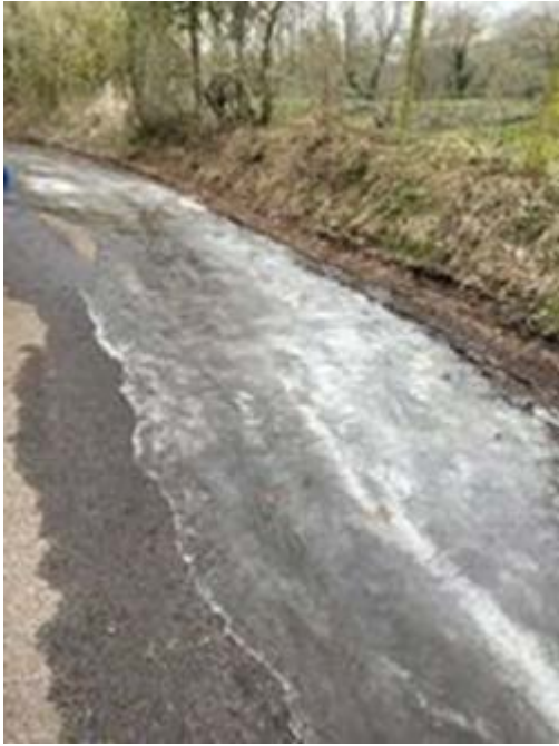
Pincents Lane during icy weather