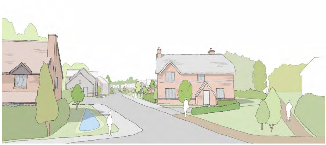
3D View from Stoney Lane