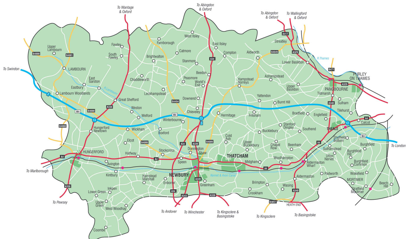
Map 1.1 West Berkshire

1.10 Employment provision is diverse. West Berkshire has a strong industrial base, characterised by new technology industries with a strong service sector and several manufacturing and distribution firms. The areas that have the highest concentrations of employment are Newbury Town Centre and the industrial areas and business parks in the east of Newbury, the business parks at Theale, Colthrop industrial area east of Thatcham and the Atomic Weapons Establishments at Aldermaston and Burghfield.