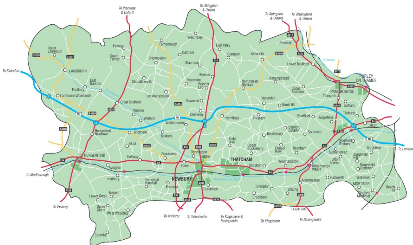
Figure 1.1 West Berkshire

1.13 Employment provision is diverse. West Berkshire has a strong industrial base, characterised by new technology industries with a strong service sector and several manufacturing and distribution firms. The areas that have the highest concentrations of employment are Newbury Town Centre and the industrial areas and business parks in the east of Newbury, the business parks at Theale, Colthrop industrial area east of Thatcham and the Atomic Weapons Establishments at Aldermaston and Burghfield.