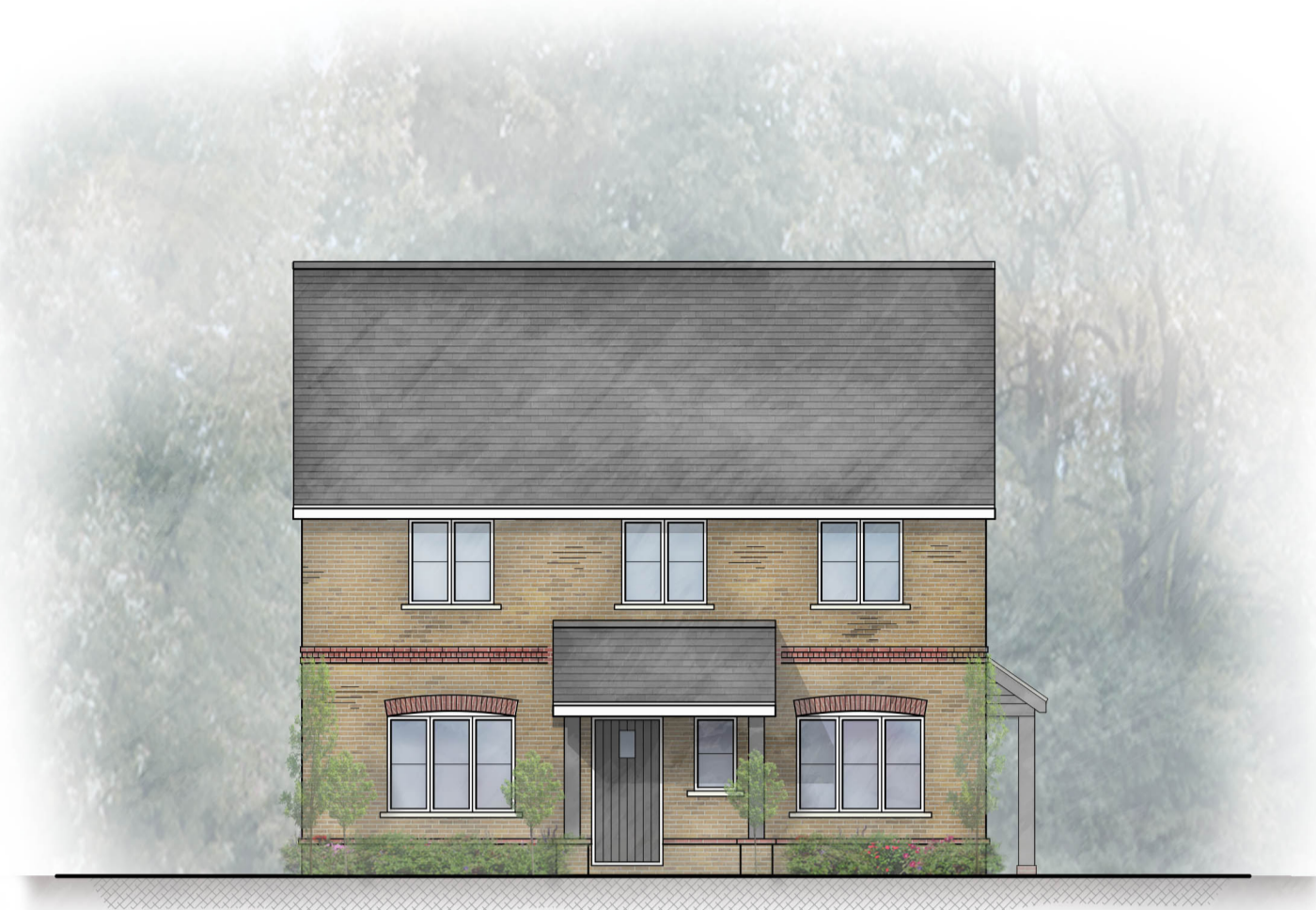
PLOT 21 FRONT ELEVATION