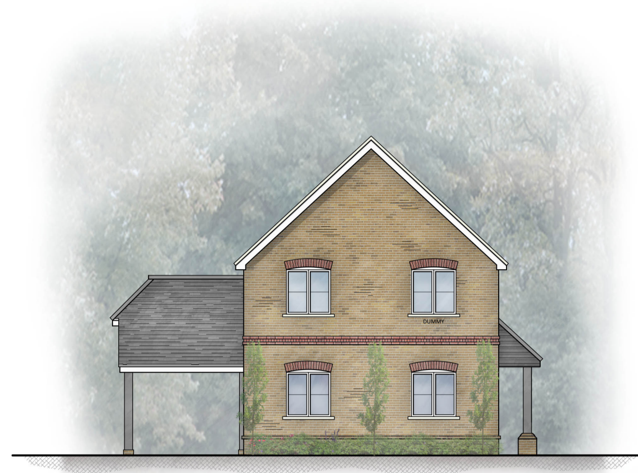
SIDE ELEVATION (ROAD)