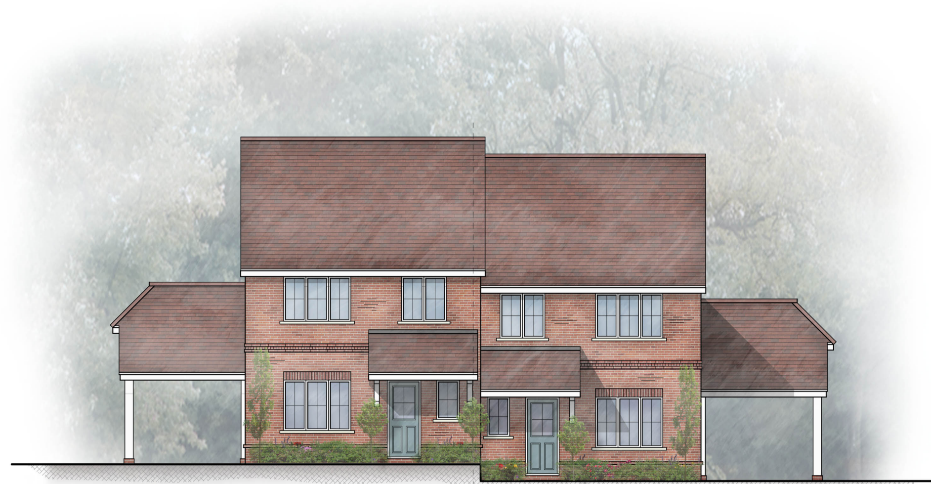
PLOT 19 FRONT ELEVATION