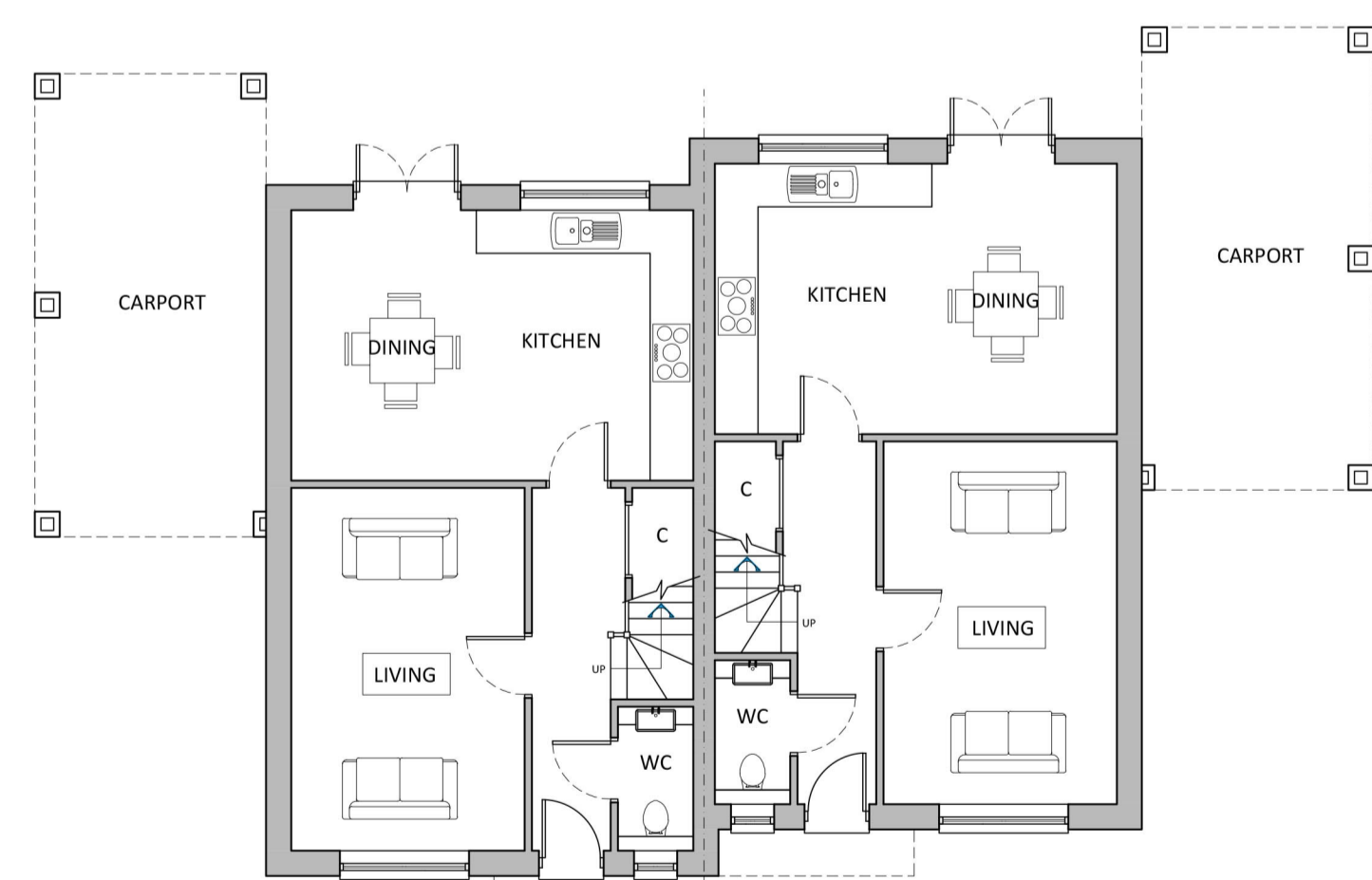
PLOT 19 GROUND FLOOR PLAN