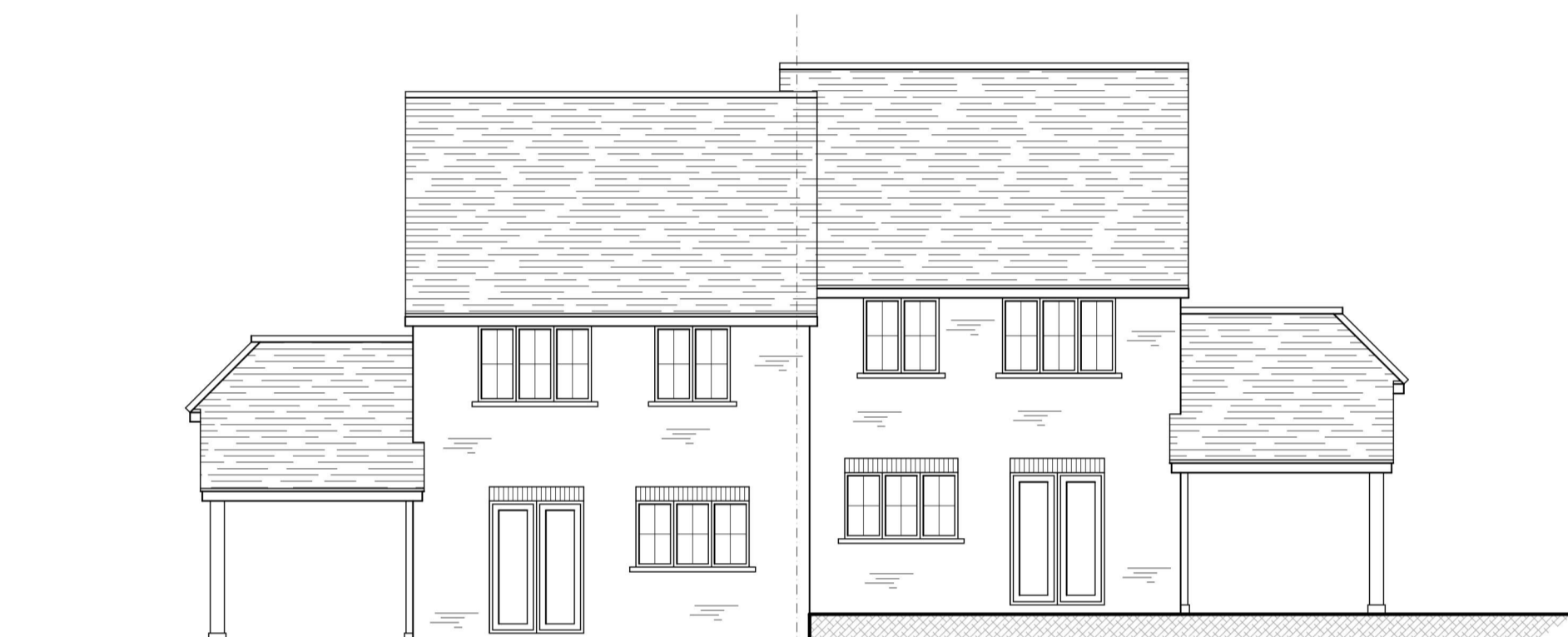
PLOT 20 REAR ELEVATION