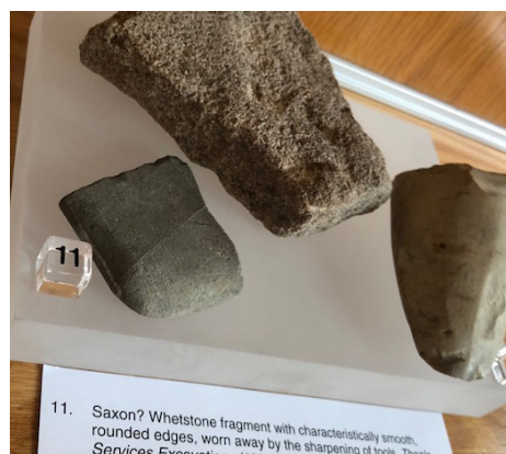
Local history exhibition organised by West Berkshire Heritage colleagues.

West Berkshire Archaeology Service, the Museum, and Library Service came together to start to plan the first of a series of pop-up exhibitions in libraries showcasing local heritage. Burghfield Library is hosting the first exhibition during June and July 2018 and an event has been arranged for June 25th for members of the parish to meet the Archaeology and Museum team and share their memories.