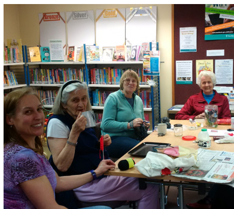
Knit and Natter at Lambourn Library

The main challenges for this year are to implement the final stages of the layout change project and also to get more children coming into the library.