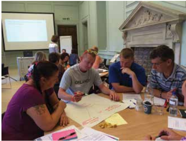
Getting involved in the 2015 Tutor Forum

Contact the community learning team to book a place.