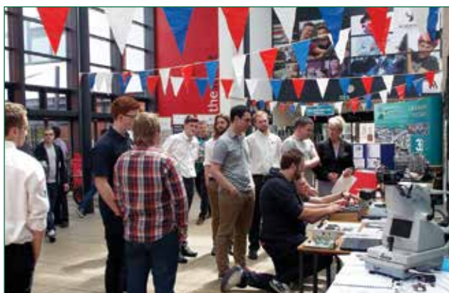
Engineering students put on exhibition at Newbury College