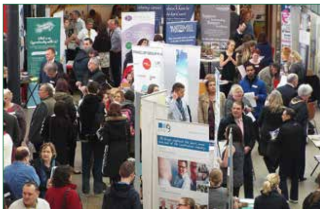
West Berkshire Work and Careers Fair 2016

The College has a number of open days and information events throughout the year and individuals are encouraged to contact the College to discuss their training and education needs. The next open evening will be on 8th November and there are also monthly apprenticeship information sessions available.