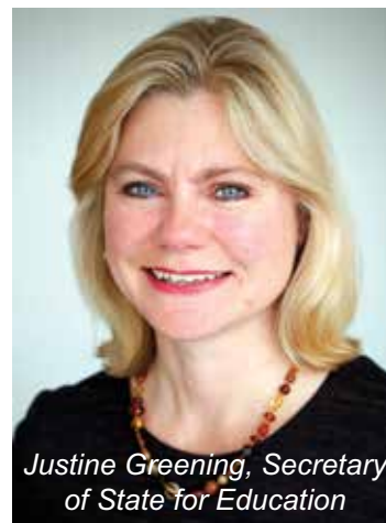
Justine Greening, Secretary of State for Education

down to regional and local levels. To ensure adults and families across West Berkshire continue to benefit from community learning provision it is important that the impact of the service is promoted across the sector. Tutors and project managers can help by feeding back on success using the course evaluation forms (ACL7), nominating someone for a Learner Achievement Award, sending an article for the newsletter or simply contacting the community learning team to promote success on Facebook or Twitter .