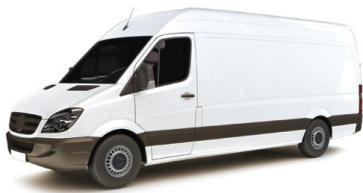
Vans exceeding 3 tonnes