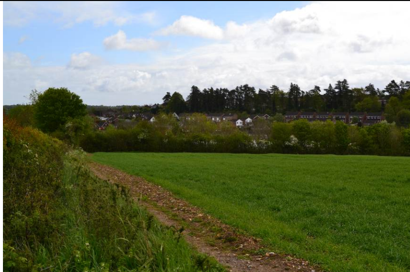
Viewpoint 3: Parts of Hungerford very visible from high ground within site.