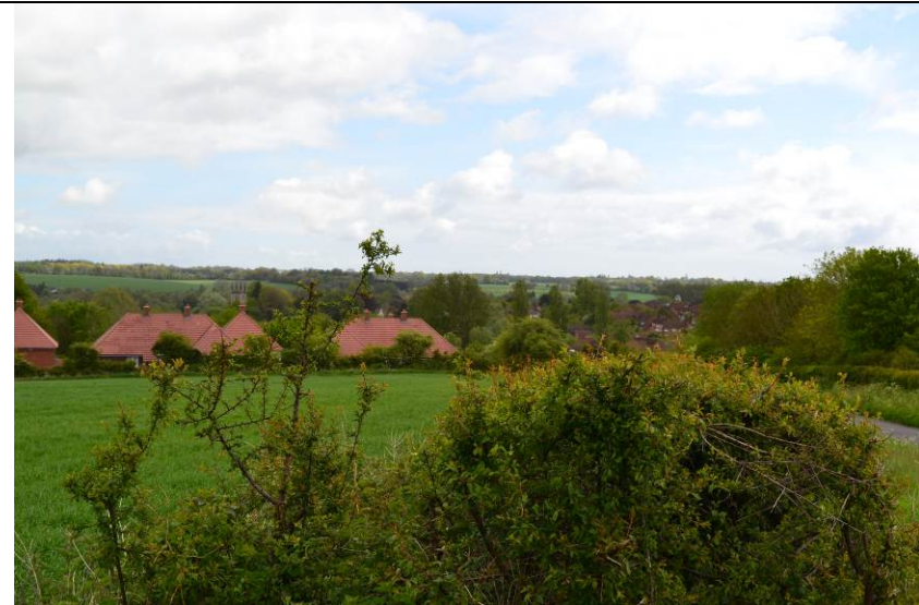
Viewpoint 2: Short section of eastern boundary adjacent to settlement