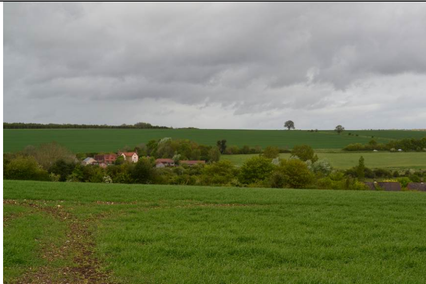
Viewpoint 1: Long views north to the wider AONB from the high ground