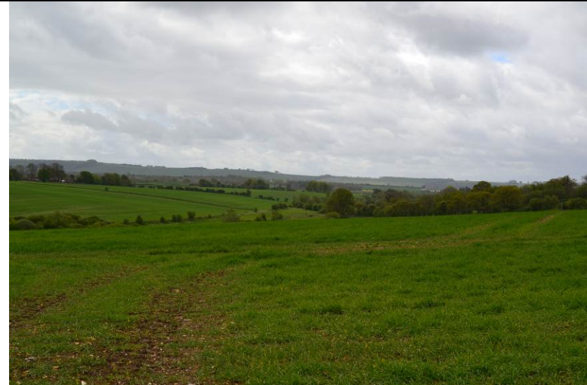
Viewpoint 4: Long views available from exposed high ground within site.