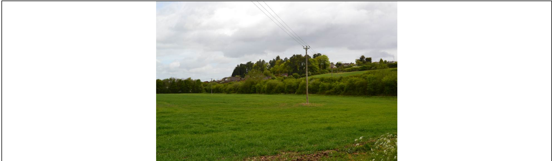
Viewpoint 5: Lower parts of site are more visually contained and Hungerford is less visible.