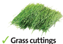
✓ Grass cuttings