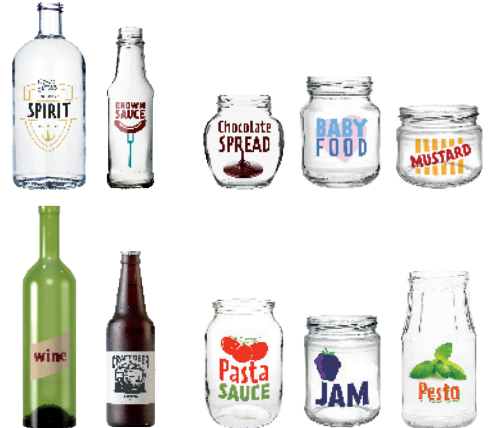
✓ Glass bottles ✓ Glass jars

As a general rule, if your plastic waste is bottle shaped it can go in the bag for recycling.