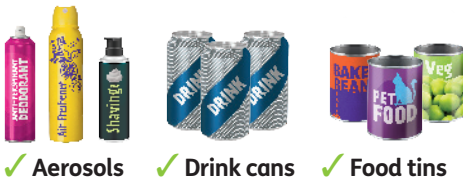
✓ Aerosols ✓ Drink cans ✓ Food tins