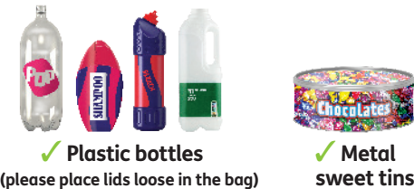
✓ Plastic bottles (please place lids loose in the bag) ✓ Metal sweet tins