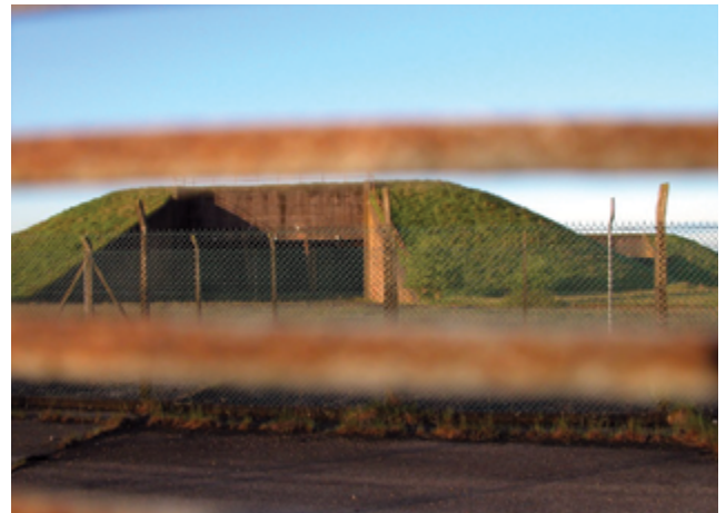
One of the missile shelters at GAMA, Greenham Common

Scheduling remains a discretionary power that applies to monuments as defined in the 1979 Act. Therefore there are nationally important archaeological monuments that remain unscheduled either because it has been deliberately decided not to schedule them, or they fall outside of the definition of an ancient monument contained in the legislation, or their full significance is not clear.