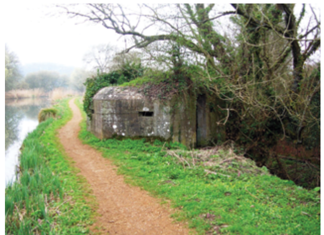
A pill box on the Kennet and Avon Canal, part of the 1940 GHQ stop line anti-invasion defences.

Through 1939 and 1940 Britain was actively developing strategies designed to halt or slow the advance of an invading German army. One of the major features constructed as part of this