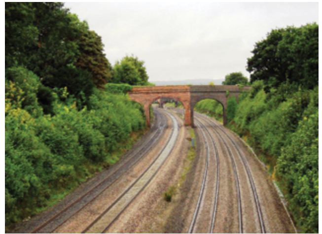
The Great Western Railway at Purley-on-Thames.

The coming of the railway might have led to the decline of the canal network, but in itself was a major achievement. Of especial importance in West Berkshire is a short section of Brunel's Great Western Railway, running through Purley,