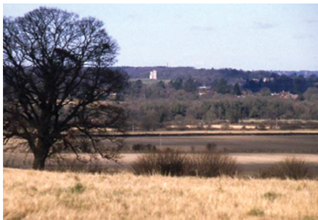
The site of the first battle of Newbury fought in 1643. Donnington Castle in the background was the site of a major Civil War siege and the focal point of the second Battle of Newbury in 1644.

Battlefields – As with Parks and Gardens, there is no statutory basis for the Register of Historic Battlefields published and maintained by English Heritage, but it is a material consideration specifically referred to in PPS5. The register was first published in 1995 following extensive research on proposed sites. Sites were only included that were both important and sufficiently well documented to allow their location to be established; the total is currently 43. In West Berkshire the First Battle of Newbury, located to the south west of the town centre on land that now lies between the Newbury bypass and the suburbs flanking Wash Common, is included on the register. The Second Battle of Newbury, which took place on a broad area north of the town between Shaw, Donnington and Speen, is not registered, but is one of several English battlefields to feature in an appendix to the register.