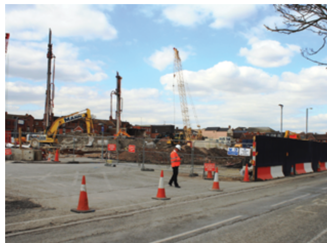
The Park Way development in the centre of Newbury. Major developments of this type will frequently require archaeological investigation as part of the process.

West Berkshire lies at the heart of central southern England and within the strategically important M4 corridor. Its relative economic prosperity, high quality environment and good communication links have provided a stimulus for significant development pressure in the District over recent years. The Council's Local Development Framework (LDF) Core Strategy identifies that over the next 20 years most new development will take place in Newbury, Thatcham and in the settlements in the east of the District close to Reading.