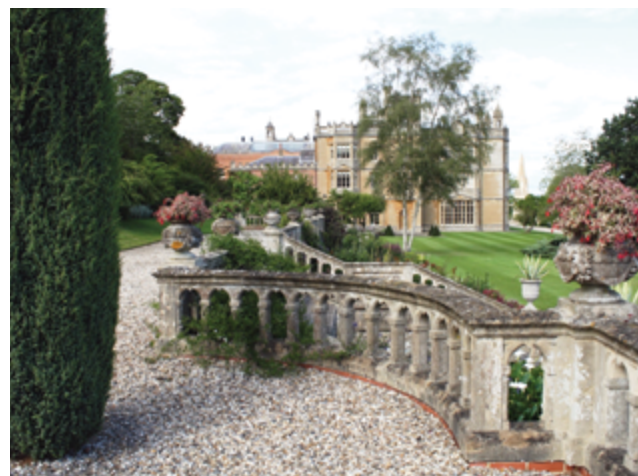
Englefield House: A Grade I listed house and Grade II registered Park and Garden.

Registered Parks and Gardens – Under the National Heritage Act 1983 English Heritage has the power to maintain a register of parks and gardens of historic interest. Although there are no statutory controls imposed by this designation, it has been used as a material consideration in the planning process and is specifically mentioned as such in Planning Policy Statement 5: Planning for Historic Environment (PPS5). Like Listed Buildings, the parks and gardens on the Register are divided into different categories (Grade I, II* and II). There are 13 Registered Parks and Gardens that lie within West Berkshire: