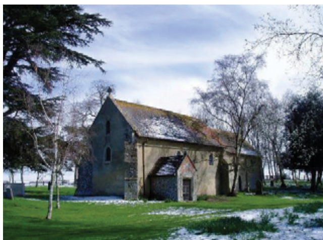
St Mark and St Luke, Avington: a fine small Norman church,

106 of the listed buildings in the district are Grade II* including: