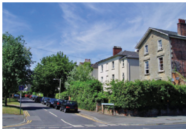
Donnington Square in Newbury. This fine planned 19 th century development is protected as a Conservation Area.

In West Berkshire there are currently 53 Conservation Areas. These include the historic cores of many of the district’s rural villages; the main town centre areas of Newbury and Hungerford; parts of the Kennet and Avon canal; examples of planned urban extensions at Donnington Square and Shaw Crescent; and designed parkland at Benham Park (a full list can be seen at www.westberks.gov.uk/index.aspx?articleid=3236 ).