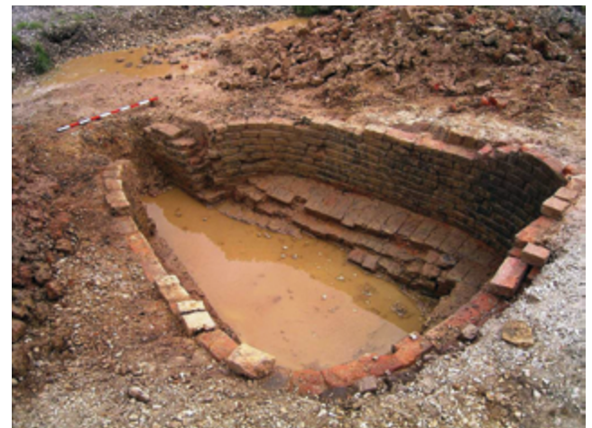
An early (17th/18th century) brick Kiln found at Raghill Quarry, Aldermaston