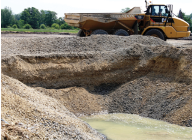
Gravel extraction in the Kennet Valley. The density and range of historic sites in the valley make ensuring an appropriate response to these activities a priority.

The Kennet Valley, especially the section between Newbury and Reading, contains major valley gravel resources. Additionally, other parts of the district contain sand and gravel deposits that are significant enough to warrant extraction. It is necessary to ensure that where extraction of minerals is proposed the impacts on the historic environment are fully considered.