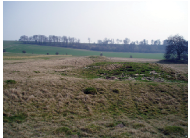
Rabbit damage to the Bronze Age barrow cemetery at Lambourn 7 Barrows.

The degradations of modern agriculture have ensured that large tracts of earthwork features such as prehistoric lynchets, medieval ridge and furrow and other ancient linear boundaries do not survive in West Berkshire. However, small pockets of earthwork features do survive, in particular within woodlands, and these need to be managed appropriately to ensure their survival.