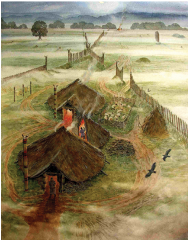
Reconstruction of the Late Bronze Age iron working site at Harts Hill, Thatcham

Lambourn, Kintbury and Thatcham were clearly all major centres during the later part of the Saxon era. Despite this we have little archaeological evidence to help us characterise them any further. Following the Norman Conquest West Berkshire experienced a boom in urban development, but unlike many places the most successful towns, Newbury and Hungerford, were new planned settlements. The processes and competing demands of these developments define the character of the district up to the modern day.