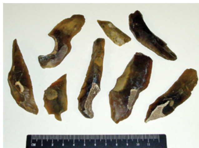
These flint tools are typical of those left behind by early post glacial communities in the Kennet Valley.

A number of excavations has demonstrated the high number of sites of the very late Upper Palaeolithic and Mesolithic periods in the Kennet